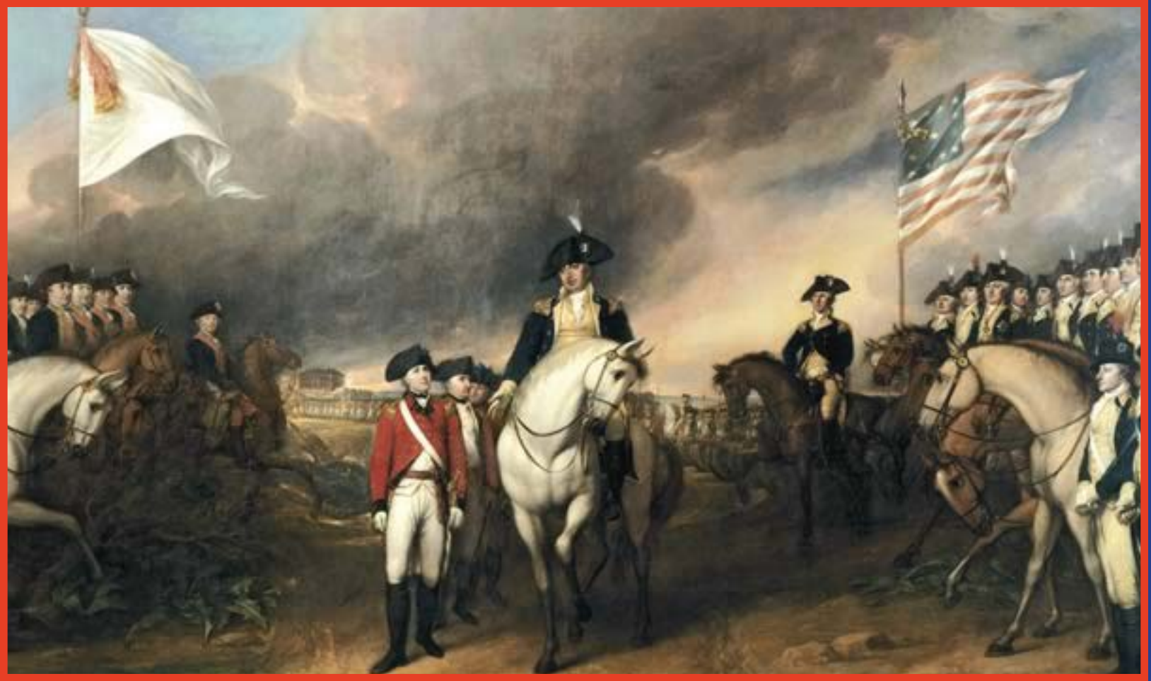
SURRENDER OF CORNWALLIS. George Washington accepts the British surrender at the end of the American Revolution. Painting by John Trumbull, 1820.