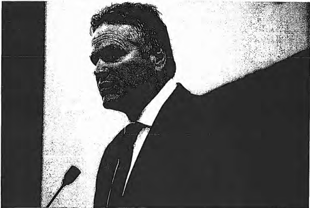
Alaska Gov.-elect Mike Dunleavy addresses the Alaska Miners Association annual conference at the Dena'ina Convention Center in Anchorage on Nov. 8.